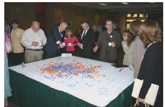
Participants consider the development pattern currently forecast by NCTCOG.

It was clear to Vision North Texas participants that continuing 'business as usual' would lead to a region with high traffic congestion and a declining quality of life. They supported change to make the region's future more successful and sustainable. And they concluded that action—by cities, developers, civic groups and others—really can make a difference.