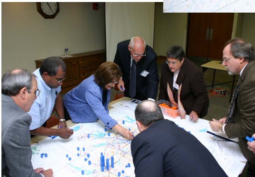
Participants from Burleson, Fort Worth, Fate and Waxahachie work with planning directors from Denton and Mesquite to locate new regional employment centers.