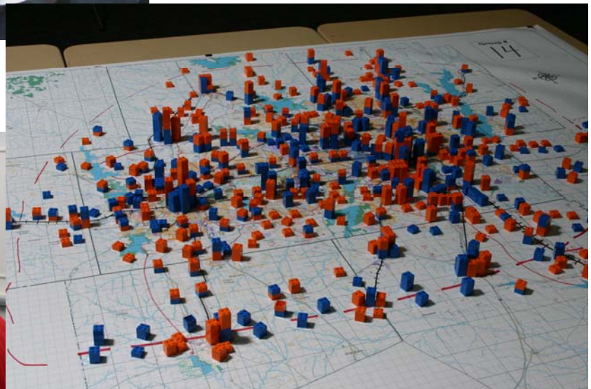
"Efficient Transportation Drives Development Design Principles" for one group of Vision North Texas participants.

50% of respondents thought the scenarios developed at the event were a good reflection of realistic choices for this region. 40% thought regional choices should include even more dramatic change from the current forecast.