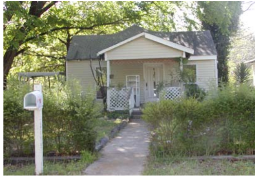
1) Existing Condition of Houses in Community 2) Remodeled houses in Community