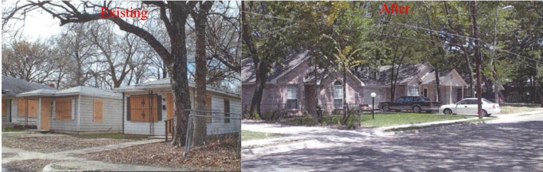
Figure 5: The Existing and New Neighborhood Center