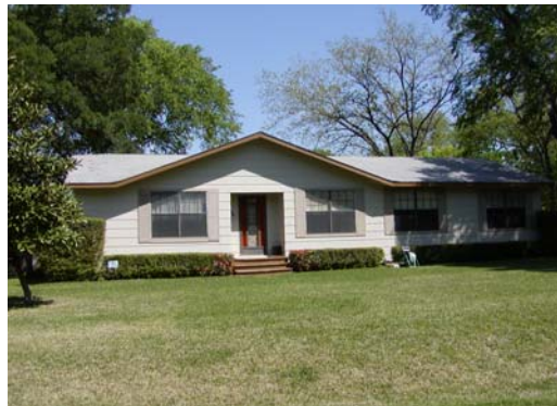
3) Houses constructed in 1980's in Community 4) New Constructed Houses in Community