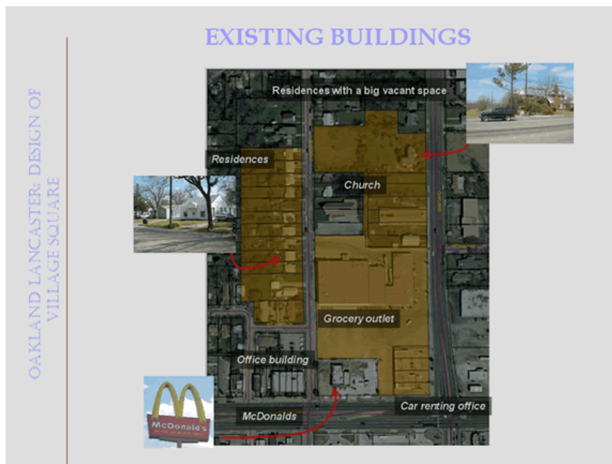
Figure 6. Existing Conditions in An Underutilized Neighborhood Center

The City of Fort Worth has begun to use the creation and revitalization of neighborhood centers as a means of revitalizing neighborhoods and returning them to vibrant centers of activity. Below is the intersection of Lancaster and Oakland. The surrounding neighborhoods were aging and basically in a state of transition with an increasing number of properties being abandoned. Strategic creation of urban centers can make a difference. Figure 6 shows existing conditions and Figure 7 shows what the intersection could be.