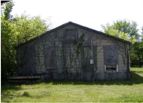
Figure 3. Existing Conditions and Redevelopment Potential